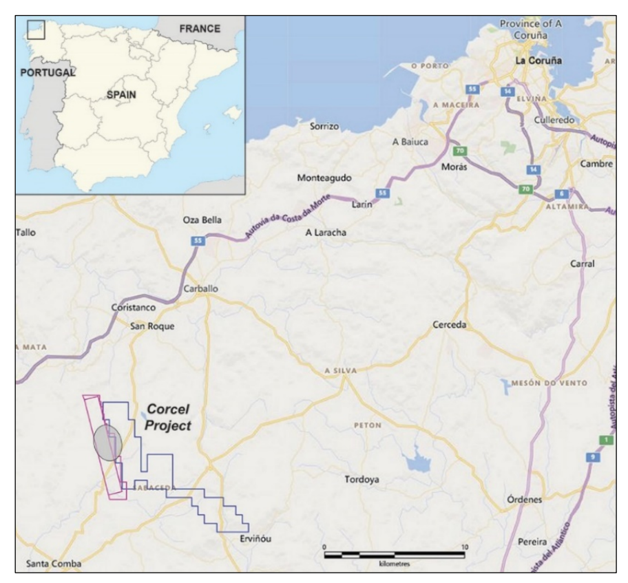
Figure 1. Location map of Corcel Project, Galicia, northwest Spain. Castriz prospect highlighted (grey ellipse).